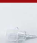
Nozzle Cap with Protective Cover