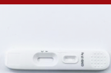
SARS-CoV-2 Antigen Test Cassette